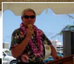
Santa Rita Springs Booster and Transmission Line Project groundbreaking